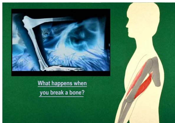
Example of an embedded video segment